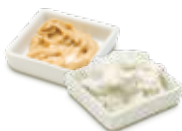
peanut butter or cottage cheese