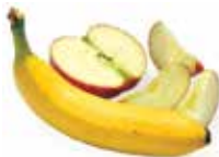
piece of fruit