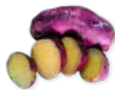
left-over cooked kūmara or taro